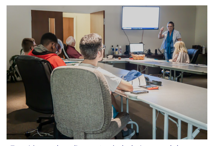
Transition students listen attentively during a workshop

Summer is here and the time is right for... Transition Student Summer Camp! Our Community Rehabilitation Provider (CRP) in the Pensacola District, Independence for the Blind NW FL, organized an action-packed week for the students that includes a mixture of work-based learning experiences, job exploration counseling and workplace readiness training. The workbased learning experiences ranged from performing maintenance at the City of Pensacola parks to doing chores at the Leaning Post Ranch, which is a very special place in Northwest Florida where individuals with disabilities and at-risk youth can receive equine facilitated therapy (The Leaning Post Ranch).